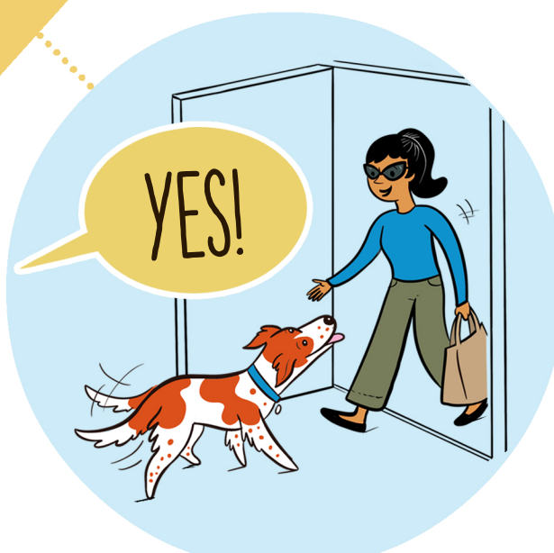
STANDS or SITS TO GREET rather than jumping